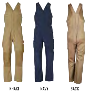
KHAKI NAVY BACK