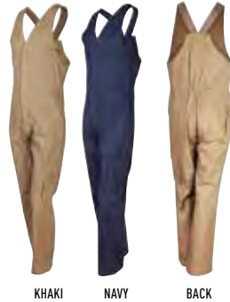
KHAKI NAVY BACK