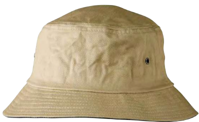
SAND/DARK NAVY UNDERBRIM

FABRIC/STYLE 100% Polyester Pique Mesh. Breathable Pique Mesh with UPF rating 50+. Elastic sweatband. One size fits most.