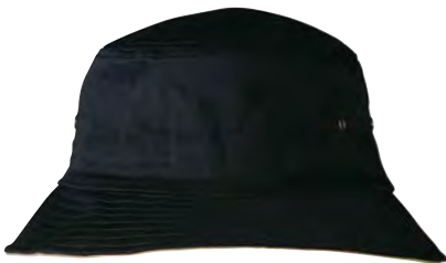
DARK NAVY/ SAND UNDERBRIM