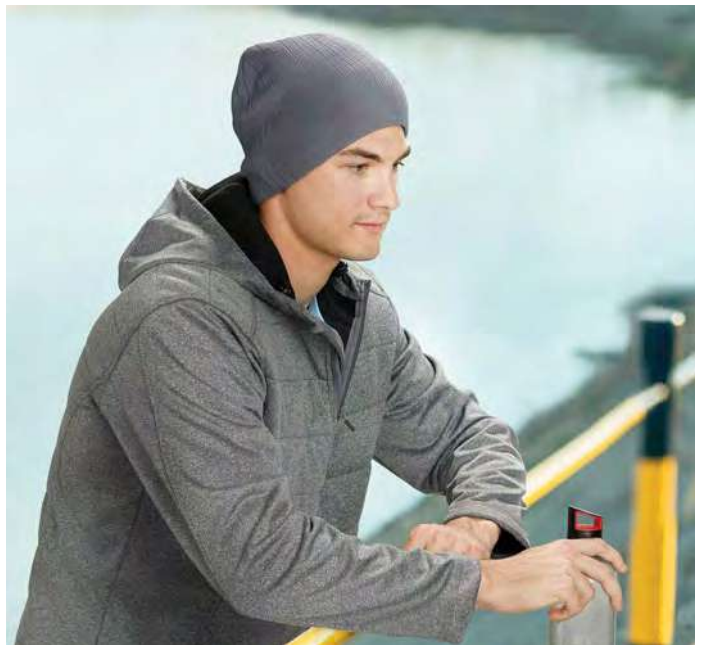
CH62 CABLE KNITTED ACRYLIC BEANIE FABRIC 100% Acrylic. One size fits most.