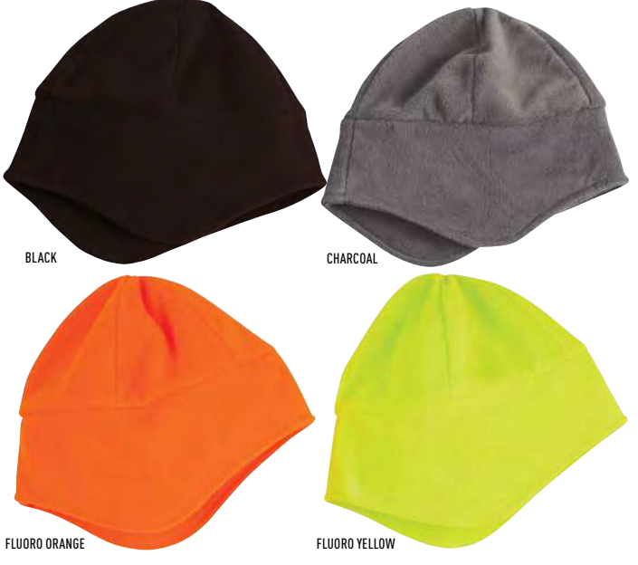
CH43 POLAR FLEECE BEANIE FABRIC/STYLE 100% Polyester. One size fits most.