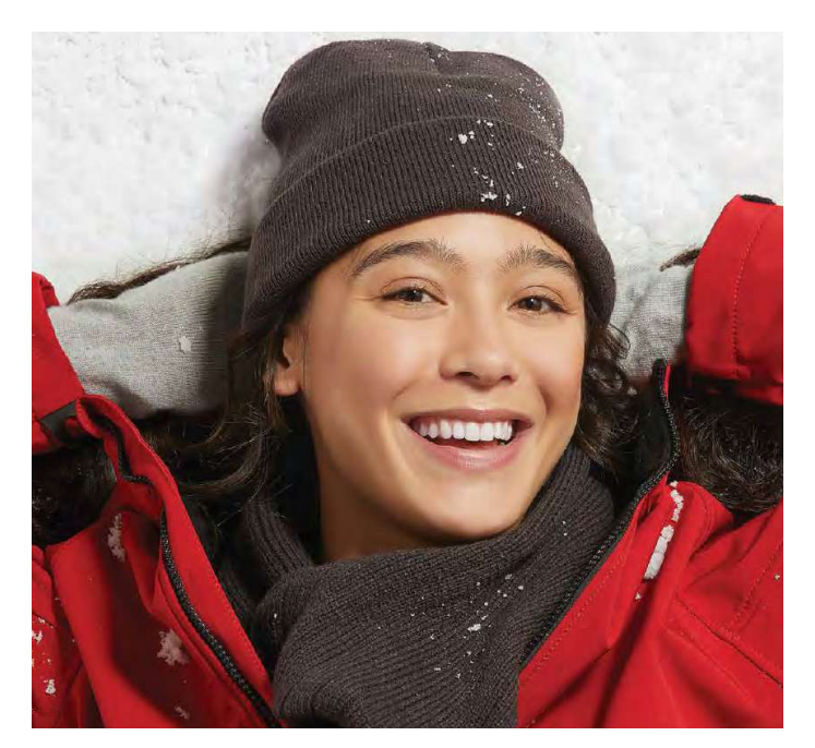
CH28 ROLL-UP ACRYLIC BEANIE