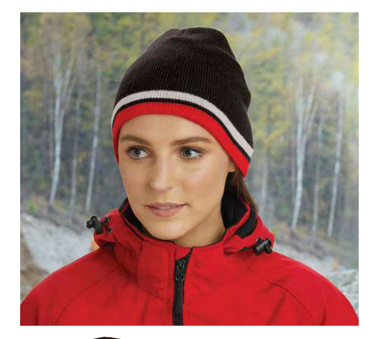
CH44 POLAR FLEECE BEANIE WITH EAR COVER FABRIC/STYLE