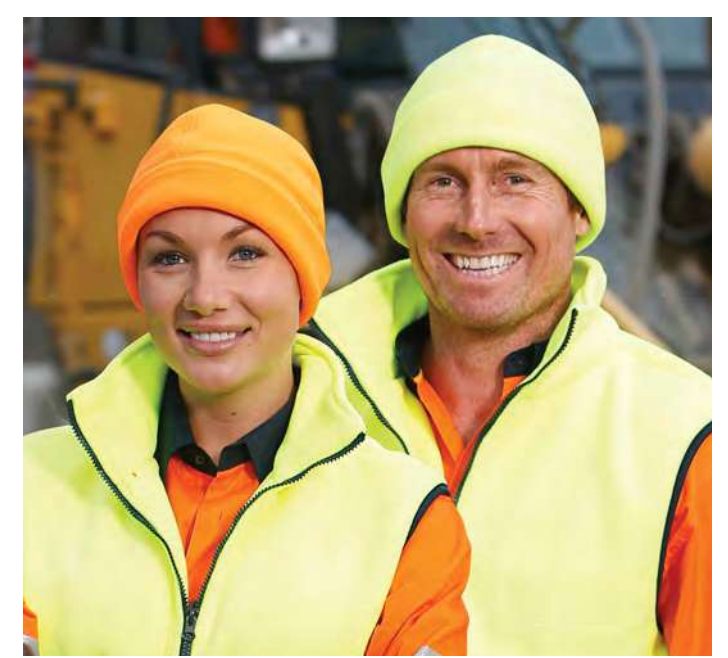
CH27 ROLL-UP POLAR FLEECE BEANIE