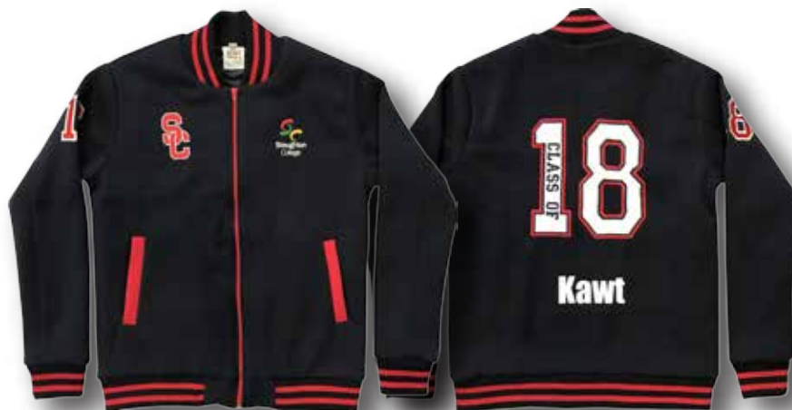
BOMBER JACKET ZIP FRONT