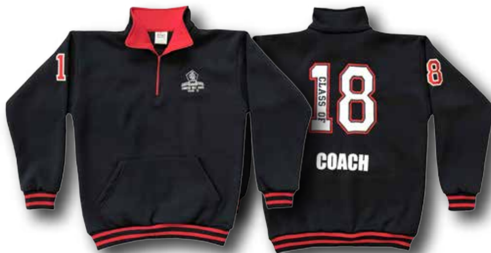
HALF ZIP JUMPER